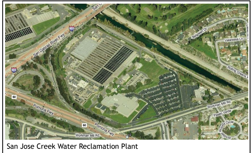
San Jose Creek Water Reclamation Plant

Directors adopted a Recycled Water Use Master Plan which identifies the costs and benefits of recycled water use and sets the stage for the future. The plan is a roadmap for expanding the existing recycled water distribution system. A fully expanded recycled water system